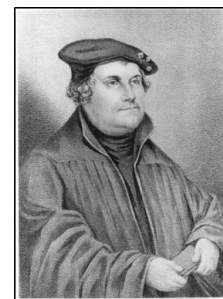
Champion of the Reformation Martin Luther 1483 - 1546